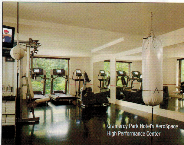
Gramercy Park Hotel's AeroSpace High Performance Center